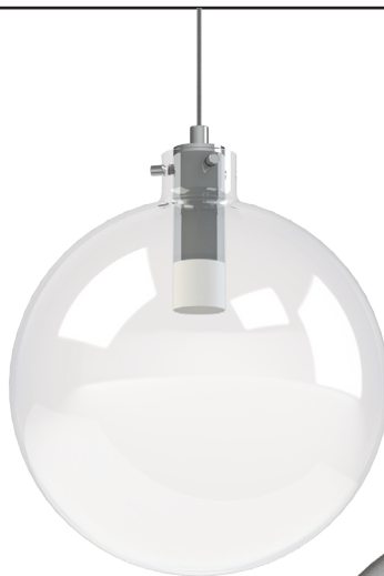
MSSC Clear Glass