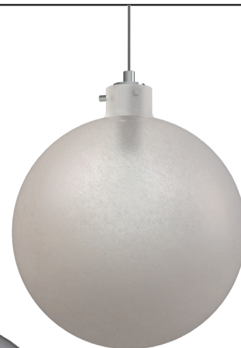
MSSF White Frosted