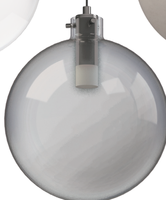
MSSS Smoked Glass