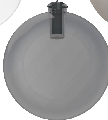
MSLS Smoked Glass