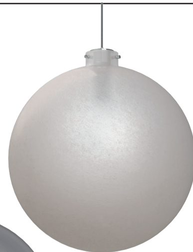
MSLF White Frosted