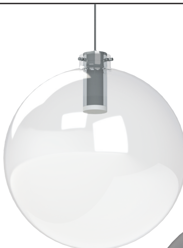
MSLC Clear Glass