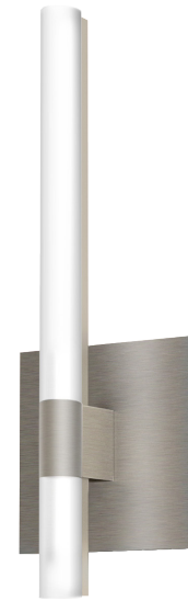
Shown Above: LIN-14S-SN-12T-30K-SO-S4