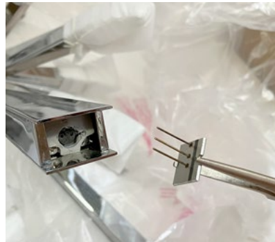
STEP 6: Using needle-nosed pliers, insert new Tri-Pin LED.

Repeat Steps 1-6 as necessary until all light guides are illuminated.