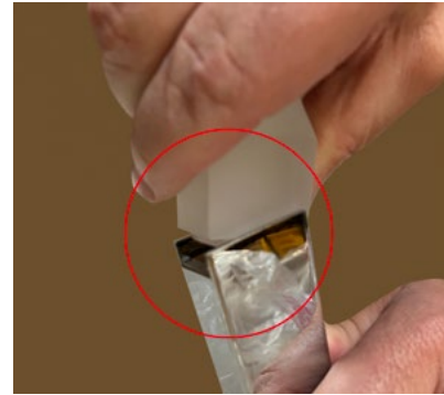
STEP 3: Gently push light guide all the way over until you see the side of the arm bend slightly.