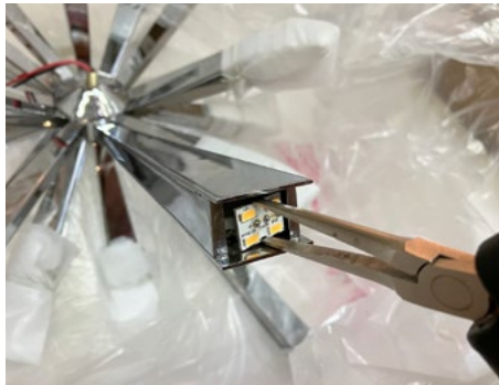
STEP 5: Using needle-nosed pliers, remove Tri-Pin LED.