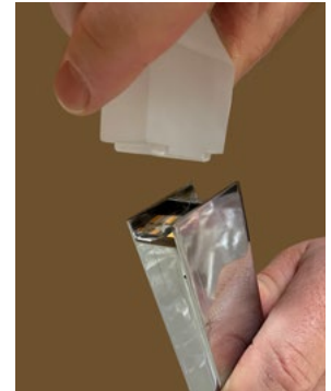
STEP 4: Gently twist and pull the light guide until separated.