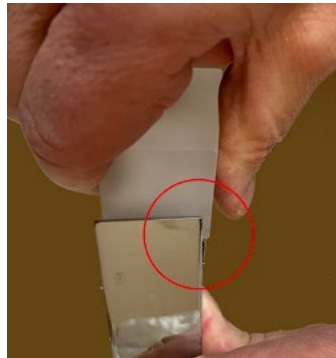
STEP 2: Push light guide toward the side with two pin holes.